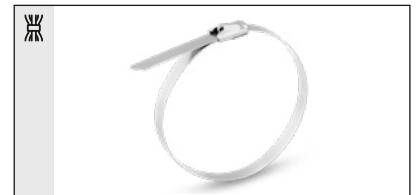
NORMAFIX® Stainless Steel CableTie